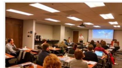
With the support of the US Economic Development Administration, the NADO Research Foundation has been a leader in training Economic Development District staff and other regional partners across the country in practical and cutting-edge approaches to CEDS planning, design, and implementation.

For years, NADO RF has provided training, resources, and tools for EDDs and other regional entities to provide a solid foundation for planning, developing, and implementing their CEDS. Some of the most popular and well-received of these resources are now archived on this page for easy access and reference. New staff working on the CEDS for the very first time as well as more seasoned veterans of the process should all find this information useful and relevant to their work. As more materials are developed through Stronger CEDS, Stronger Regions, stay tuned to www.nado.org and our Facebook and Twitter pages for the latest on CEDS development, resilience planning, and new approaches for getting the most out of your CEDS to make it a true, inclusive driver of regional economic development.